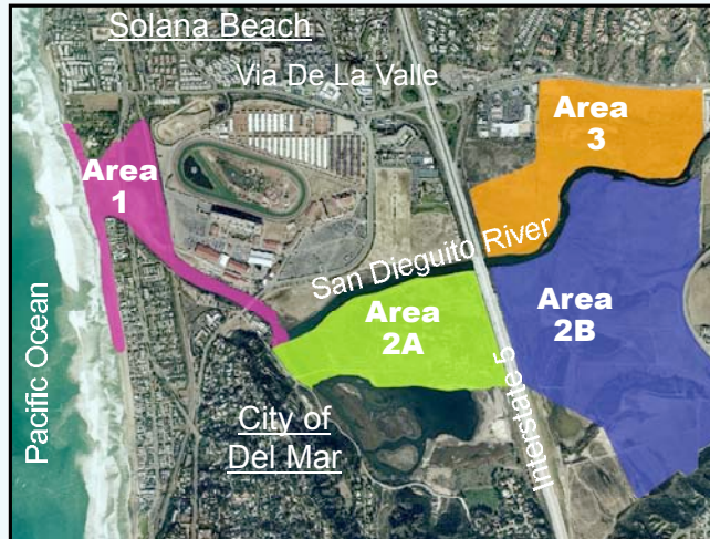
San Dieguito Wetlands Project Work Areas

VISIT THE NEW PROJECT WEBSITE: www.sdlagoon.com