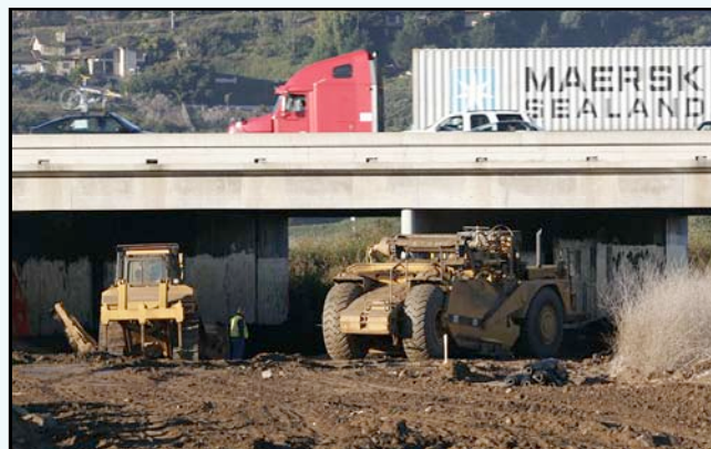
Creating haul road underneath I-5 freeway