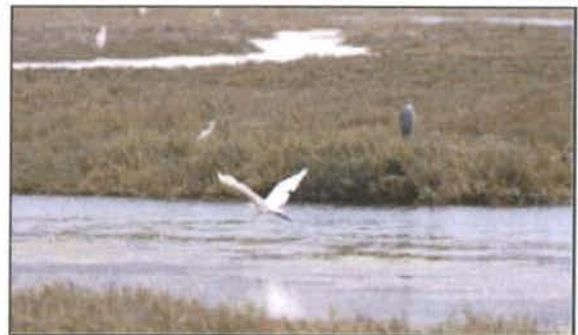
A snowy egret flew over the San Dieguito Lagoon yesterday. Work on restoring the wetland to a more natural state will begin in mid-September.

In addition to obtaining the California Coastal Commission's stamp of approval, Edison has secured permits from, among others, the U.S. Army Corps of Engineers, the California Department of Fish and Game, the California Water Quality Control Board, the